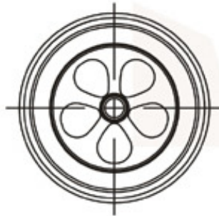
1" ALUM, FULL RANGE