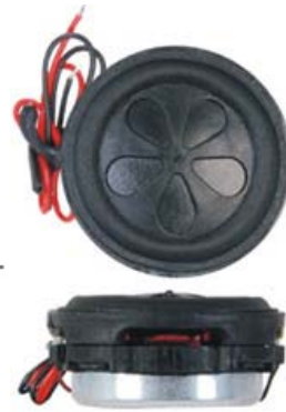
OD=18.4MM, FULL RANGE