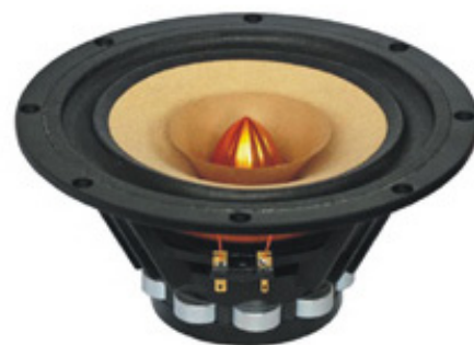
8" PAPER FULL RANGE