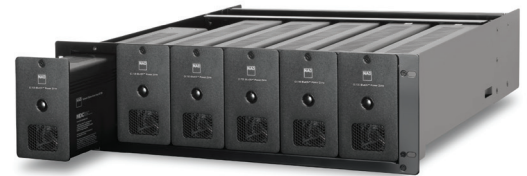
Six CI 720 mounted in RM720 rack (optional accessory)

The 60-watt per channel, single-zone CI 720 Network Stereo Zone Amplifier with HybridDigital™ amplification technology is the perfect addition to today's most advanced custom home audio systems. Featuring 60 watts per channel, and powered by BluOS™, the advanced music management operating system, the CI 720 allows you to access and stream 24-bit high-res music with the control of a smartphone or tablet via Ethernet and third-party control systems like Control4, Crestron, RTI and URC.