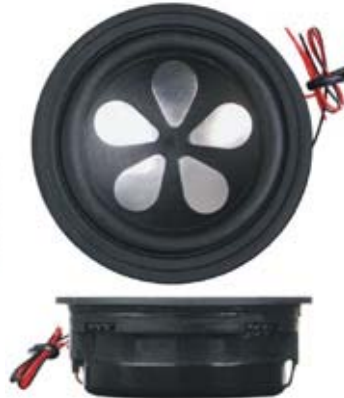
1" ALUM, FULL RANGE