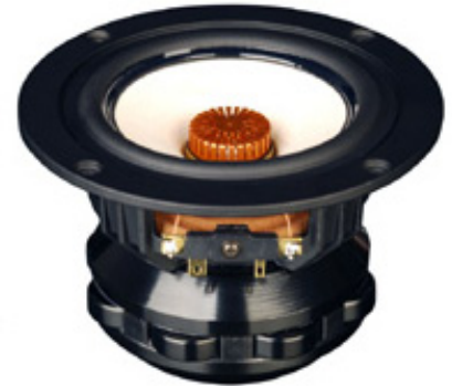
4" PAPER FULL RANGE