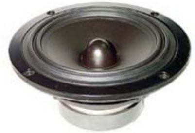
5" PPM WOOFER