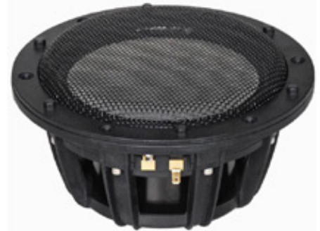
6.5" SANDWICH MID RANGE