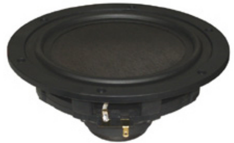
6.5" ALUM. SUBWOOFER